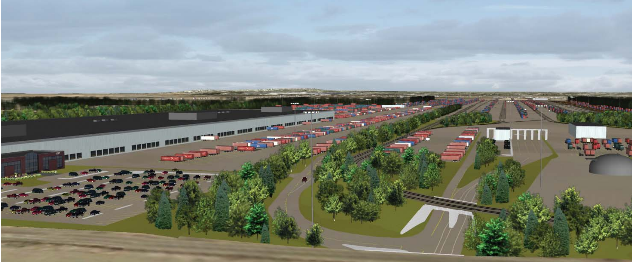
Les Cèdres Intermodal Complex

THE GROWTH IN IMPORTS OF PRODUCTS MANUFACTURED IN ASIA HAS RESULTED IN MAJOR DEMAND FOR TRANSPORTATION INFRASTRUCTURE. AN INCREASING NUMBER OF CONVENIENCE GOODS, SUCH AS ELECTRONICS AND APPLIANCES, COME FROM ASIA, AND ONCE THEY ARRIVE IN CANADA THEY NEED TO FIND THEIR WAY TO CANADIAN CONSUMERS. CP'S EXISTING FACILITIES IN MONTRÉAL HAVE REACHED FULL CAPACITY, AND NEW INFRASTRUCTURES MUST NOW BE DEVELOPED TO SERVE THE GREATER MONTRÉAL AREA. THE LES CÈDRES INTERMODAL COMPLEX CONSTRUCTION PROJECT IS INTENDED TO FILL THIS NEED.