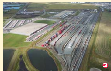
The Calgary Intermodal Complex.