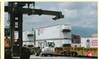
Merchandise is unloaded from trains and transported to the distribution centre, where various activities take place, such as packing and labelling. From there, the merchandise is transported by truck to various locations, including big-box stores in the region.